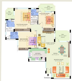
THREE BEDROOM APARTMENT - TYPE B 1880 sq ft